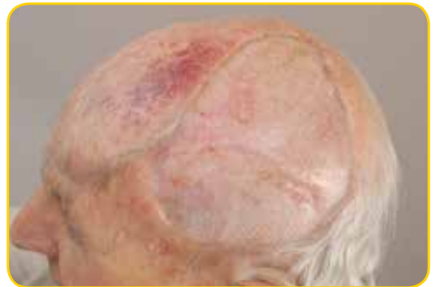
A mature skin graft on the scalp