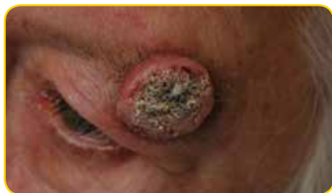
SCC above the eye

Your doctors may suggest you use an ointment (Efudix or Aldara) to treat areas of superficial squamous cell carcinoma (Bowen's disease). These ointments are designed to make the affected area inflamed (hot and red) so that the body's own defence cells (immune system) can enter and destroy any abnormal tumour cells. Treatment is normally applied for 3–6 weeks and can take up to 12 weeks to fully settle down. Your doctor will then check if it has been successful.