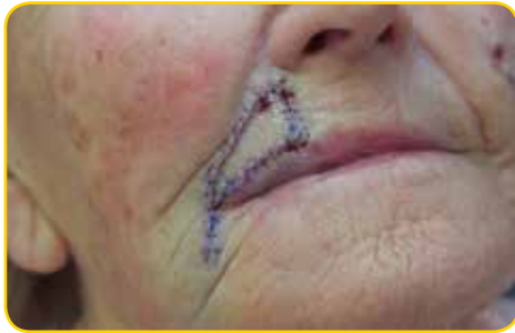
This flap has been moved to rebuild a wound on the upper lip – immediate postoperative appearance

This flap is also used for closing a wound on the face, but can also be used on other parts of the body. It is called a V-Y flap because the flap is developed as a 'V' shape and after it is advanced forward to close the wound by the surgeon it takes on a 'Y' shape. It is particularly useful for defects along the side of the nose.