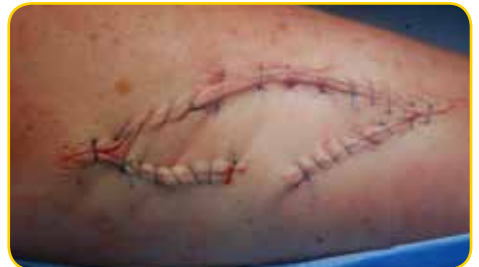
Immediate postoperative appearance