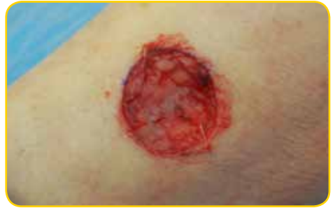
Following removal of the tumour, a split skin graft has been sutured into place

Your surgeon may put small holes into the graft to help the skin graft to survive. After the graft is secured to the wound, a dressing is applied to hold the graft in place to help healing. The donor site where the graft has been taken is also dressed. After five to seven days, the skin graft will be checked to see if it is healing. The donor site is left for longer, usually two to three weeks, to fully heal.