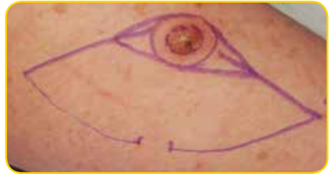
The lesion is marked out and the flap designed ready to rebuild the wound

This flap is useful for closing wounds on the arms and legs.