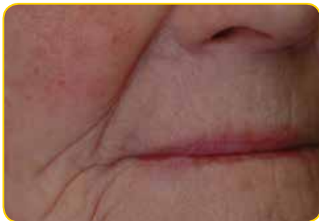
V-Y advancement – flap after three months