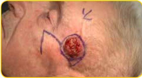
The lesion is marked out and the flap designed ready to rebuild the wound

This flap is often used on the head and neck region and its name is based on the fact that the flap of skin used to rebuild the wound approximates a rhomboid shape. Your surgeon will design the flap, to make use of adjacent spare tissue to fill the defect, whilst trying to arrange the scars to blend into the normal creases and lines of the face.