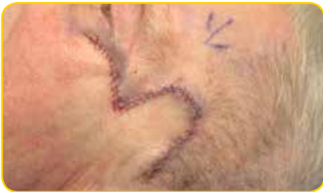
Immediate postoperative appearance