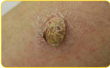
SCC on a leg

Split thickness skin grafts consist of shaving a thin layer of skin, usually tissue-paper thick, from a site which will usually heal well, such as the thigh, buttocks or calf. This 'donor site' will require a dressing and is usually healed by two to three weeks (much like a graze). The area will remain pink for some months afterwards but usually fades eventually to a barely perceptible scar.