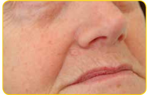
BCC on the upper lip

Occasionally your doctor will recommend a combination of ointment to the affected area before you sit beneath a specially designed light that activates the treatment to destroy abnormal cells in the skin. The treatment is carried out as a single outpatient visit and can take a number of weeks to settle down. Your doctor will assess its effects and can repeat it if necessary.