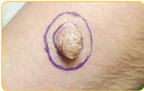
Area to be removed is measured and marked

Your surgeon may put small holes into the graft to help the skin graft to survive. After the graft is secured to the wound, a dressing is applied to hold the graft in place to help healing. The donor site where the graft has been taken is also dressed. After five to seven days, the skin graft will be checked to see if it is healing. The donor site is left for longer, usually two to three weeks, to fully heal.