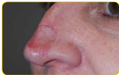
A mature full thickness skin graft on the nose

Full thickness skin grafts differ from split thickness skin grafts in that the full thickness of the skin is removed rather than a shaving. The donor site is directly closed and not left as a surgical graze as in the split thickness skin graft approach. Typical sites of the body used for harvesting a full thickness skin graft include the neck, behind the ear, the upper arm, and the groin. A FTSG finds it harder to pick up a new blood supply, because it is thicker and so it is even more important to leave the dressing intact until it is removed by the surgical team, five to seven days later.