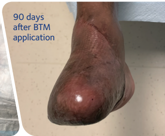
90 days after BTM application