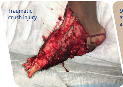
Traumatic crush injury