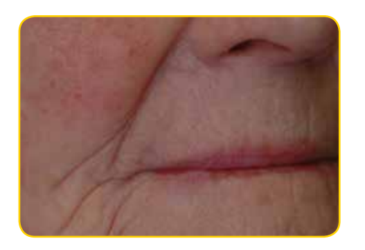
V-Y advancement - flap after three months