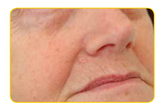
BCC on the upper lip

In some special circumstances patients are offered a new chemotherapy medicine (vismodegib) to treat advanced basal cell carcinomas. This treatment is usually only used for very aggressive disease that cannot be treated by an operation.