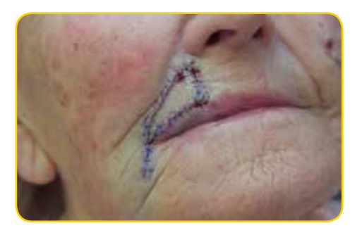
This flap has been moved to rebuild a wound on the upper lip – immediate postoperative appearance

This flap is also used for closing a wound on the face, but can also be used on other parts of the body. It is called a V-Y flap because the flap is developed as a 'V' shape and after it is advanced forward to close the wound by the surgeon it takes on a 'Y' shape. It is particularly useful for defects along the side of the nose.