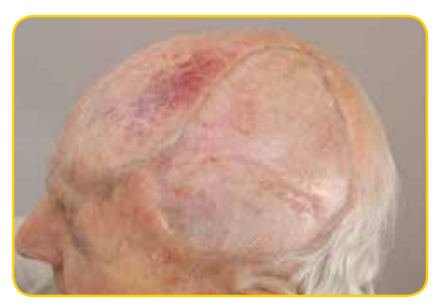
A mature skin graft on the scalp