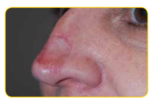
A mature full thickness skin graft on the nose

Full thickness skin grafts differ from split thickness skin grafts in that the full thickness of the skin is removed rather than a shaving. The donor site is directly closed and not left as a surgical graze as in the split thickness skin graft approach. Typical sites of the body used for harvesting a full thickness skin graft include the neck, behind the ear, the upper arm, and the groin. A FTSG finds it harder to pick up a new blood supply, because it is thicker and so it is even more important to leave the dressing intact until it is removed by the surgical team, five to seven days later.